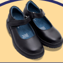
Mary Jane Size Conversion